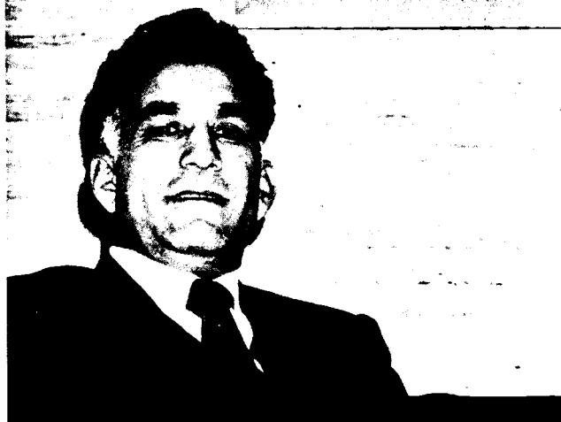
Hafizullah Amin, Prime Minister of the Democratic Republic of Afghanistan, pictured in September 1978 when he was Deputy Prime Minister and Minister of Foreign Affairs of the Khalq regime. Behind Amin is a photo of Nur Mohammad Taraki, President of the DRA, whom Amin succeeded as Prime Minister of the Kabul government.