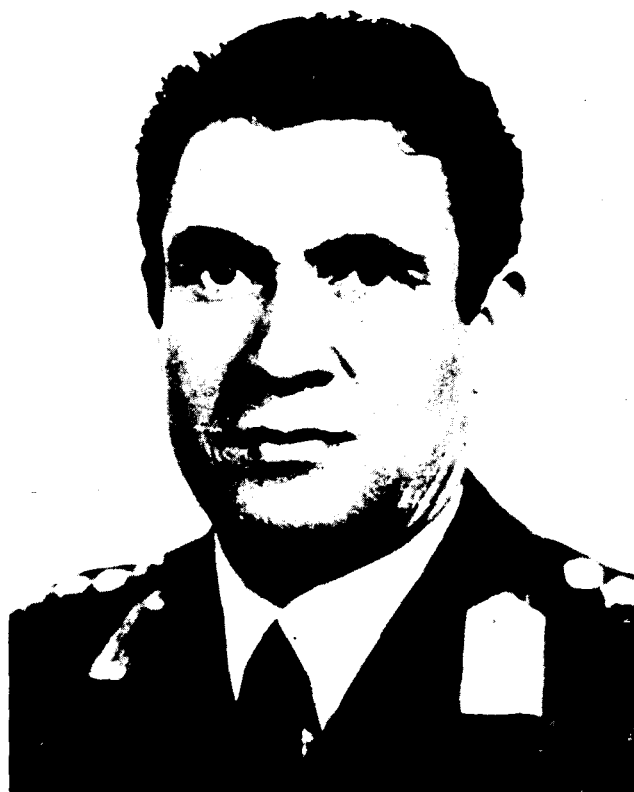
Abdul Qader, Afghan military figure promoted to major-general and named Minister of National Defense in the Revolutionary Council established after the 1978 coup in Afghanistan. Qader was one of a number of Muslim nationalists expelled from that body in August 1978.

Once the inability of Parcham 's leaders to defend their position became clear, the Khalq -dominated Revolutionary Council under Taraki moved quickly against them. Most, including Babrak, were "exiled"