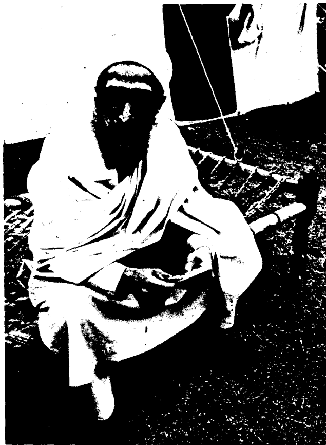
Hazrat Sebratullah Mojadidi, leader of Jabhai-yi-Nejat-i-Meli (National Liberation Front), a grouping of organizations in Afghanistan opposed to the Khalq regime. Mojadidi is pictured in Peshawar, Pakistan, in early 1979.

Vietnam, the war was fought by predominantly conscripted American and South Vietnamese troops, on the one hand, and by partly conscript Viet Cong and North Vietnamese Army regulars, on the other; in Afghanistan, the fighting so far has been between the overwhelmingly conscript Afghan army and their Soviet advisers, on the one hand, and all-volunteer antigovernment forces (including some Pushtun tribesmen from the Pakistani side of the Afghanistan-Pakistan border), on the other. Finally, although the USSR and China never committed large numbers of combat troops to the Vietnam war, the former and to a lesser extent the latter did render massive aid to North Vietnam and the Viet Cong. There is no evidence to substantiate claims by Kabul and Moscow that outside forces are taking part in the fighting against the Khalq regime. If such involvement does exist, it has not been a major factor to date.