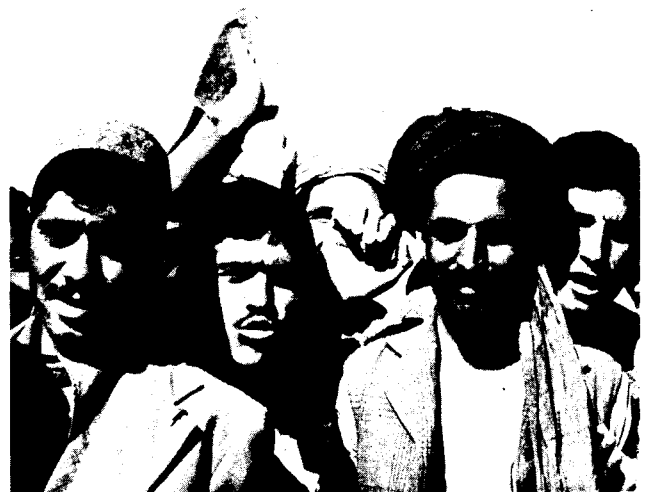
A 1979 photo of Afghan peasants who had gained ownership of land under reforms initiated by the revolutionary regime in Kabul.

The Revolutionary Council also issued a number of laws and regulations which were for the most part charters to fight corruption and to assist in the creation of cooperatives and agricultural credit and loan