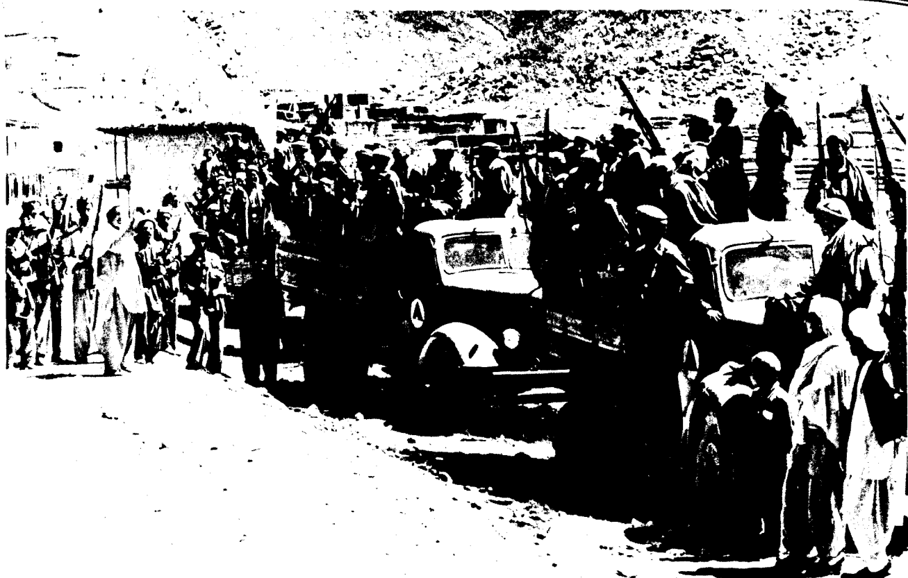
Afghan Islamic forces opposed to the Khalq regime gathered in April 1979 in Barkandei, an old district center in Afghanistan's Pich Valley (north of the Khyber Pass between Afghanistan and Pakistan), before returning to their posts in the mountains.