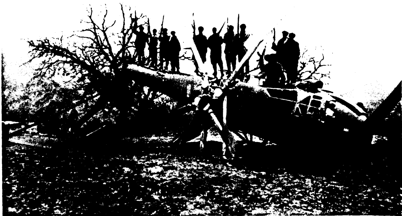
Anti-Khalq Islamic guerrillas of the Nuristan region of northeast Afghanistan pose on a downed Soviet-made helicopter that had been in the service of regular forces of the Kabul regime and was downed in March 1979.