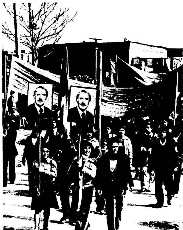
A demonstration in support of the revolutionary government of the Democratic Republic of Afghanistan, in the streets of Kabul in May 1979. The women in the foreground bear portraits of President Nur Mohammad Taraki.

In spite of periodic persecutions, the sparks of liberalism remained alive in Afghanistan during this period, fanned in 1947 by the creation of the reform-minded brotherhood, Wikh-i-Zalmayan (Awakened Youth). 5 The first public acknowledgment of the existence in the country of organized leftist movements occurred during the "Liberal Parliament" period (1949-52) which began two years later, when the government held relatively free elections (by Af-